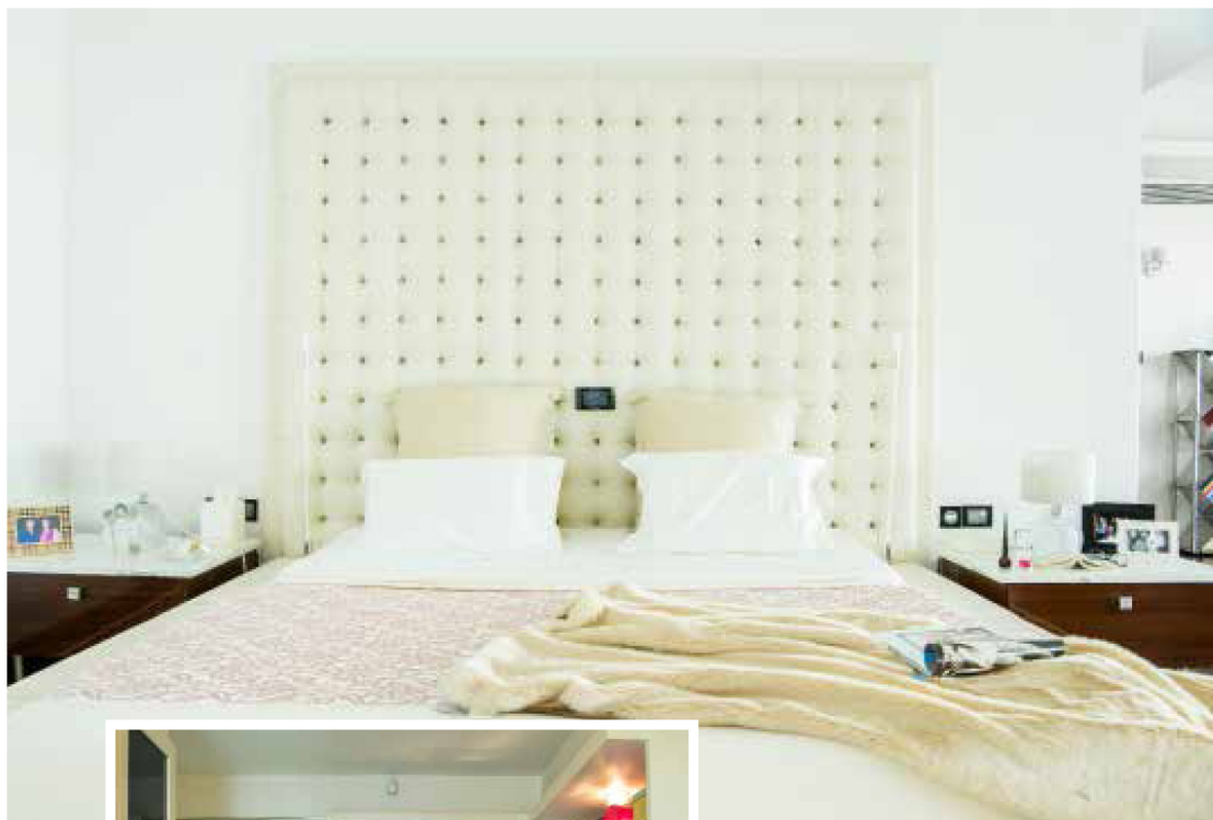
← MASTER BEDROOM A buttoned leather headboard takes pride of place in a simple clean bedroom. No clutter because a lot of storage was planned into the design. Get the look Fendi Casa makes beds with leather headboards. Visit Ace Maison for Fendi Casa pieces.