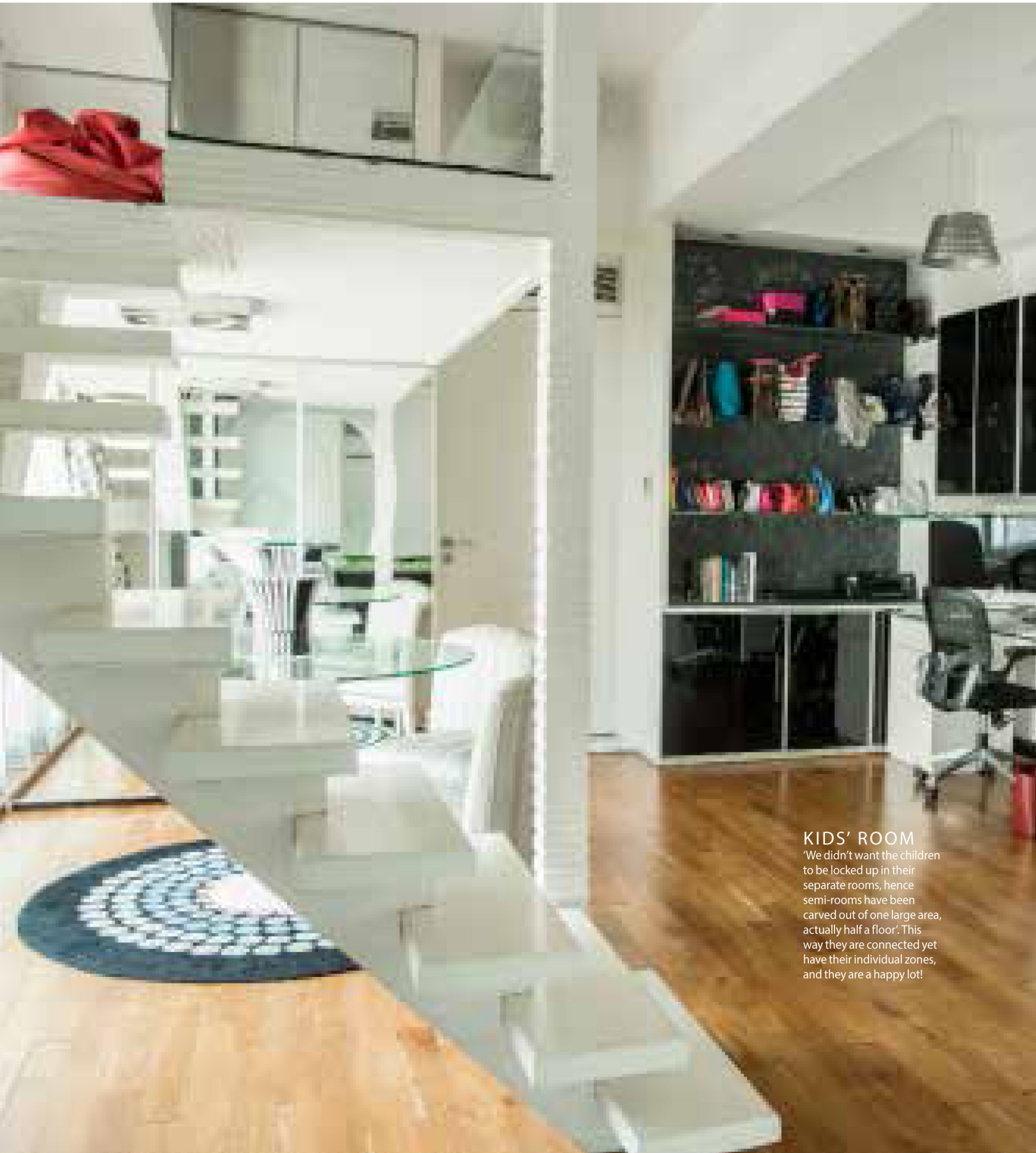
KIDS' ROOM 'We didn't want the children to be locked up in their separate rooms, hence semi-rooms have been carved out of one large area, actually half a floor'. This way they are connected yet have their individual zones, and they are a happy lot!