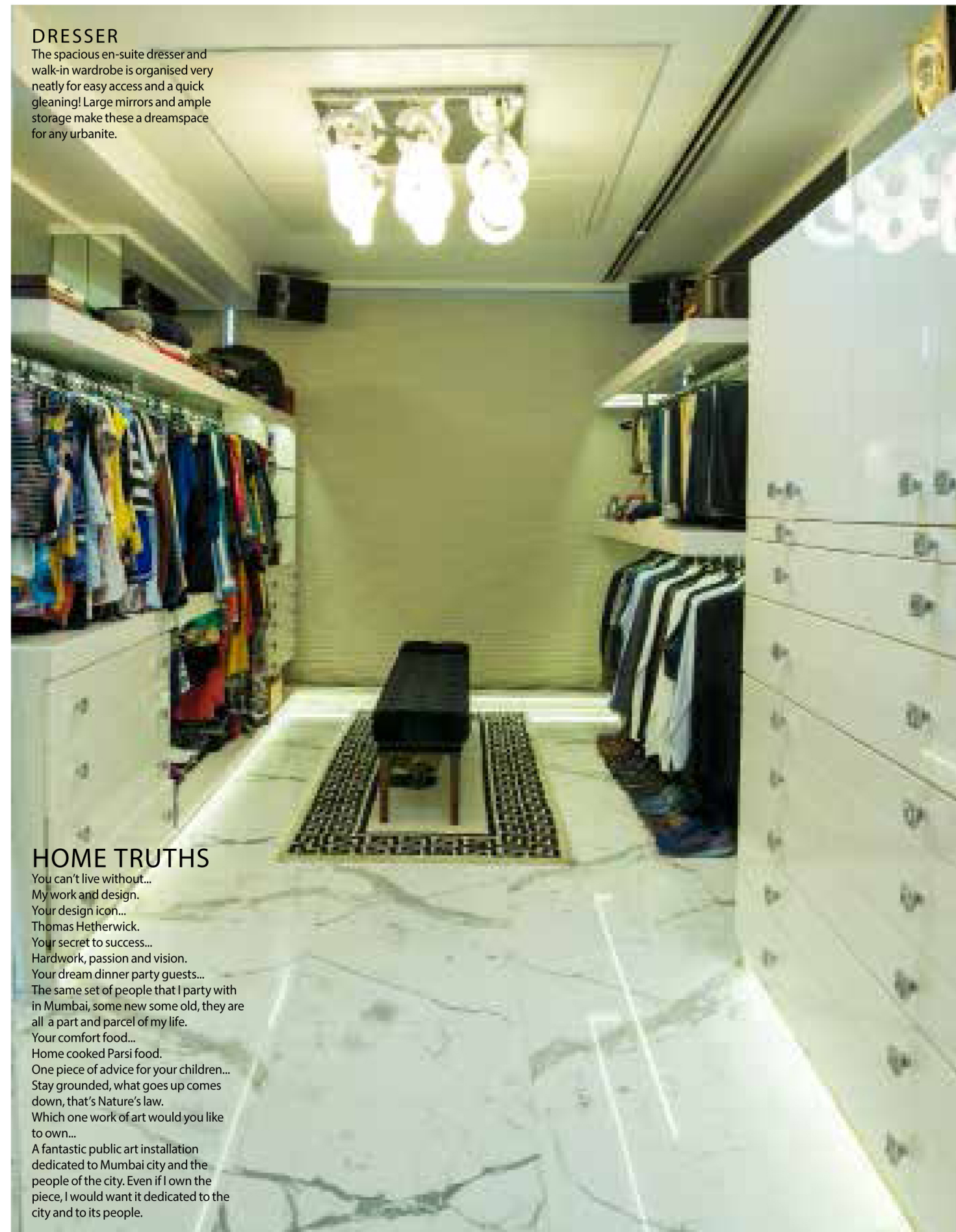
DRESSER The spacious en-suite dresser and walk-in wardrobe is organised very neatly for easy access and a quick cleaning! Large mirrors and ample storage make these a dreamspace for any urbanite.

'A PLACE FOR EVERYTHING AND EVERYTHING IN ITS PLACE'