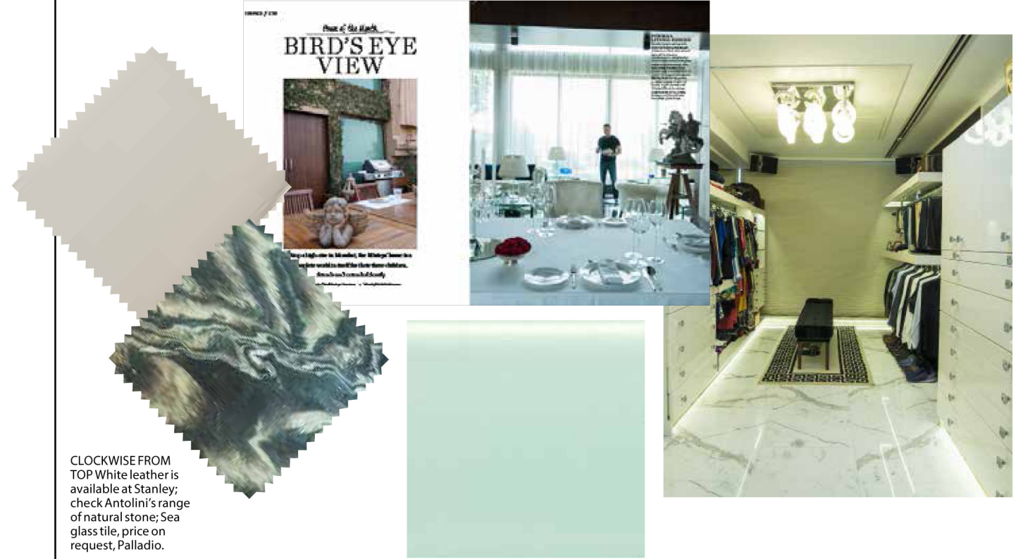
CLOCKWISE FROM TOP White leather is available at Stanley; check Antolini's range of natural stone; Sea glass tile, price on request, Palladio.

White surfaces and clear glass objects – a classic combination.